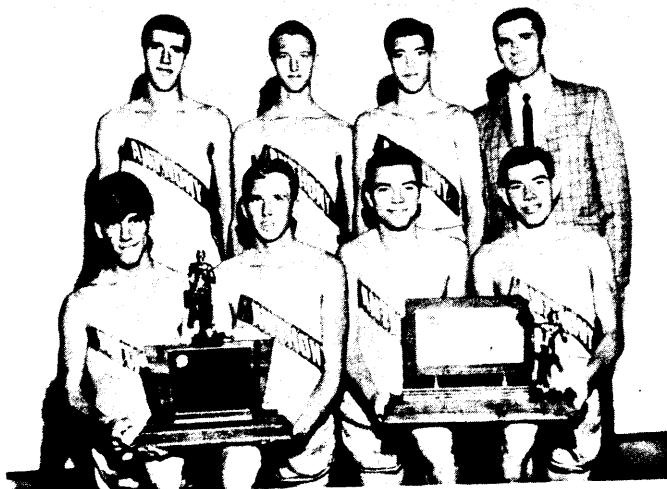
Anthony High School