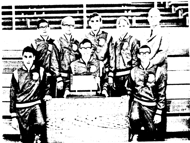
Sacred Heart (Salina) High School