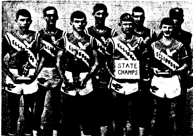
Ellinwood High School