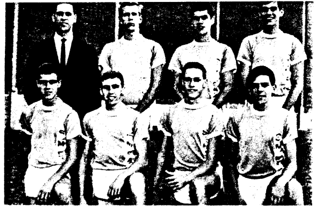
Shawnee Mission East High School