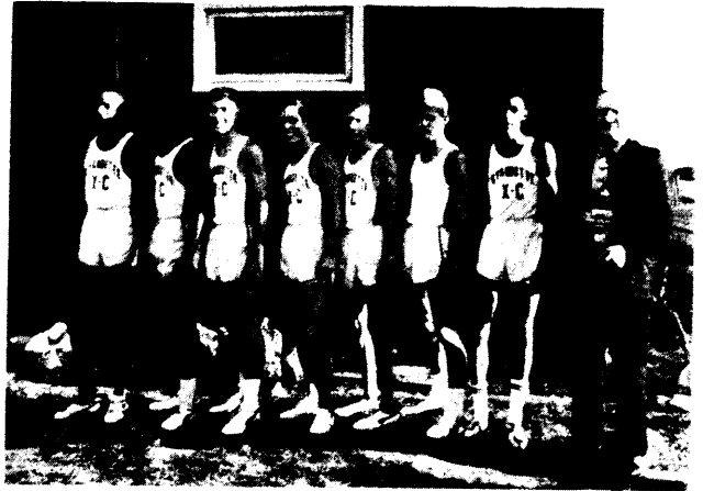
Wyandotte High School