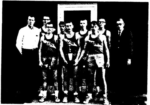
Leon High School